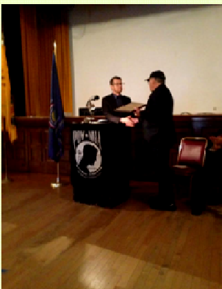
President Dos Santos accepting from Hon. Rep. Barbara Lee's staff representative a plaque with the House of Representative Resolution in memory of Oakland's 100 Vietnam Veterans KIA.